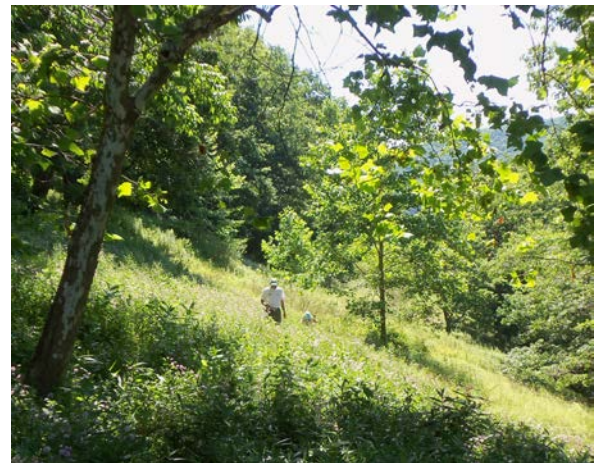
Friends of Allegheny Wilderness hikers high above the Allegheny River in the proposed Scandia National Recreation Area during a day-long hike on Monday, July 2nd, 2012.

ignore the Wilderness Act, the Endangered Species Act, Solid Waste Disposal Act, and National Environmental Policy Act along with many other federal laws on countless refuges, wilderness areas, and conservation areas.