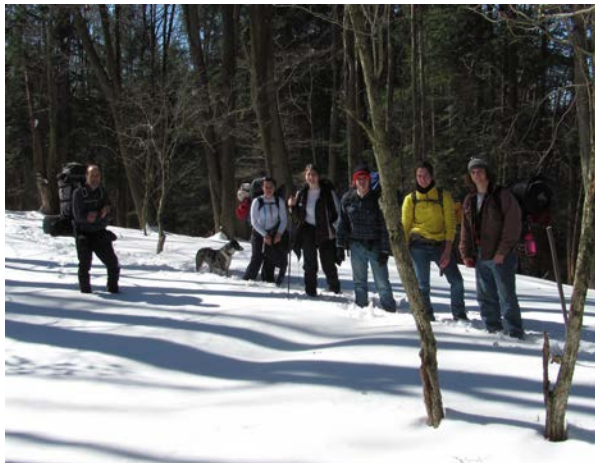
Members of FAW during an annual winter backpacking trip. The pictured trip from March, 2010 was almost all off-trail within the Hickory Creek Wilderness.

The dates and location for the annual Friends of Allegheny Wilderness winter backpacking trip have been selected, and this year we will be teaming up with Allegheny Outfitters of Warren – an endorsing business of FAW and the Citizens' Wilderness Proposal for Pennsylvania's Allegheny National Forest . During the U.S. Forest Service's most recent ANF Forest Plan revision, FAW and the Citizens' Wilderness Proposal received the support of more than 6,800 out of 8,200 total public comments!