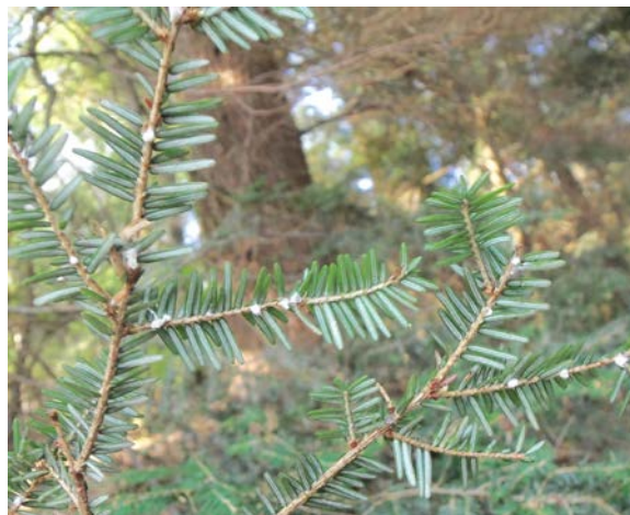
Hemlock branch infested with hemlock wooly adelgid within FAW’s proposed Cornplanter Wilderness Area, August 2013.

For those interested in helping us with our ongoing surveys for the non-native invasive insect hemlock wooly adelgid, deadly to the native Eastern hemlock ( Tsuga canadensis ), please contact FAW at info@pawild.org . We can use all the help we can get!