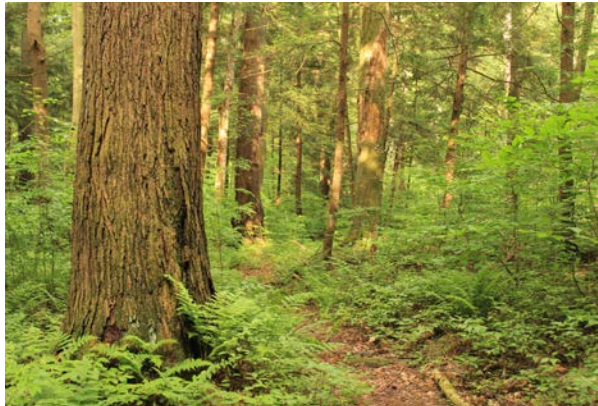
Stunning ancient hemlock trees in the Allegheny National Forest near Tionesta Creek.

The group, which has some 4,900 supporters, is also engaged in stewardship, tackling at least two major trail clearing efforts each year.