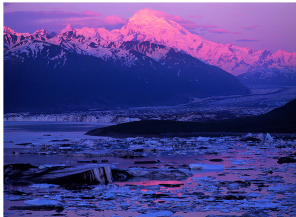
Mount Fairweather and the Alsek Glacier within Alaska's 2,664,876-acre Glacier Bay Wilderness, Glacier Bay National Park and Preserve.