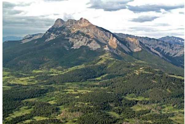
Photo of the Rocky Mountain Front addition to the legendary Bob Marshall Wilderness in Montana.