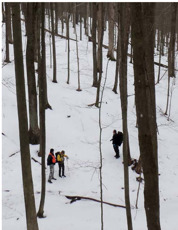
Three of the hikers from FAW are shown off in the distance at the bottom of a ravine during the group's 2014 winter backpacking trip.

presence of the invasive hemlock wooly adelgid threat.