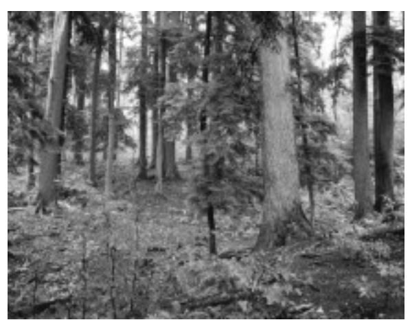
The Tionesta Research Natural Area old-growth forest.

For further information on the Friends of Allegheny Wilderness Tionesta Wilderness Area proposal or reprints of the paper, please call (814) 723-0620, or email alleghenyfriends@earthlink.net.